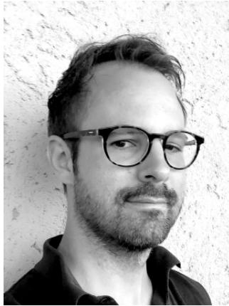
Downing College, University of Cambridge